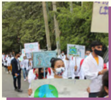
White Coat Ceremony